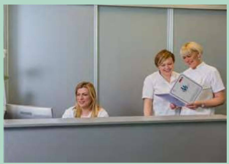
POLYCLINIC IVF ART success rate